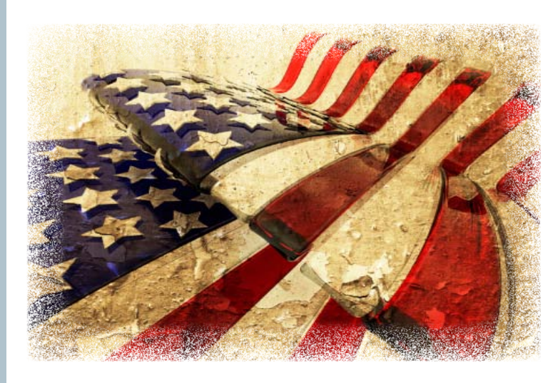
Have a Safe and Happy 4th of July