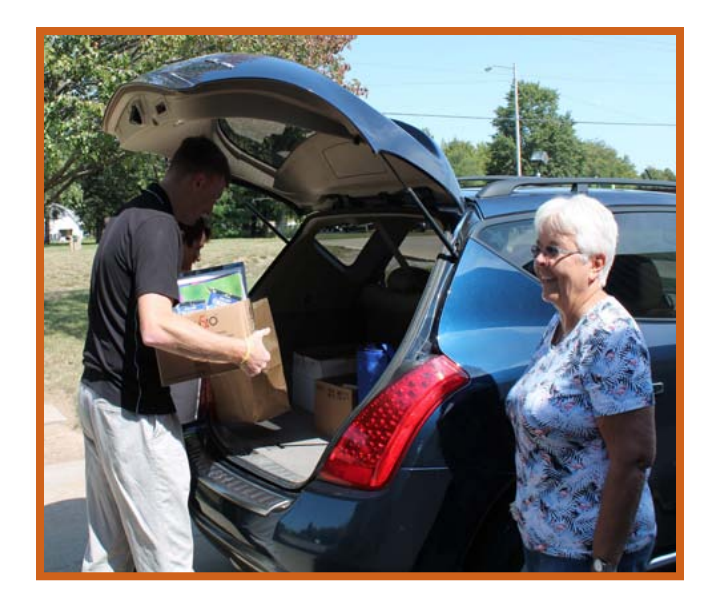
Our 9-11 Day of Service and Remembrance was a collection project to help the local V.A. Clinic for our Veterans. We delivered an abundance of books and puzzles for the Veterans to enjoy and provided over 60-plus calendars so that the Veterans could keep track of their needed appointments.