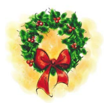
DeWitt County RSVP