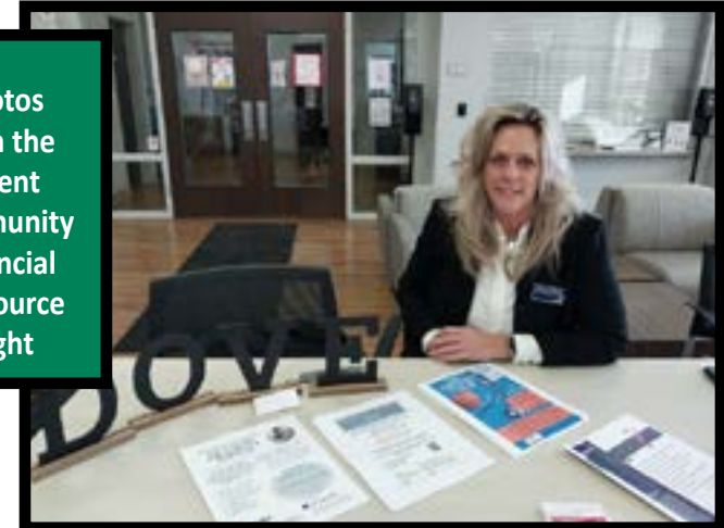
photos from the recent Community Financial Resource Night